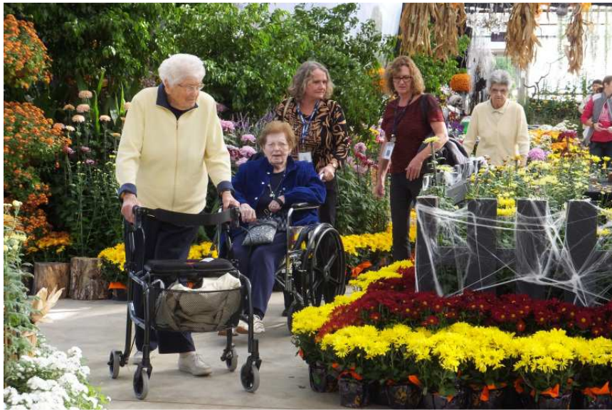
Edgewater residents enjoy an outing to Gage Park in Hamilton.