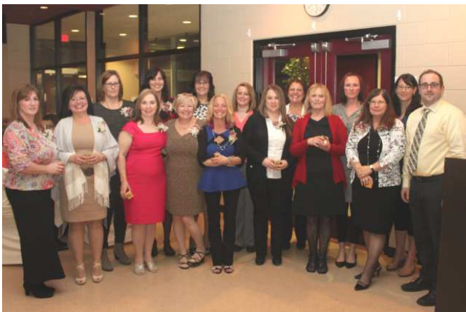
Edgewater employees receive their ten-year awards at our Annual Awards Dinner in 2016

Staff Retention : We will increase the number of staff education opportunities. We will continue to enhance the effectiveness of our performance review processes. We will explore new ways of communicating with our staff. Our employee satisfaction rate in 2016 was 83% and we want to increase this even further.