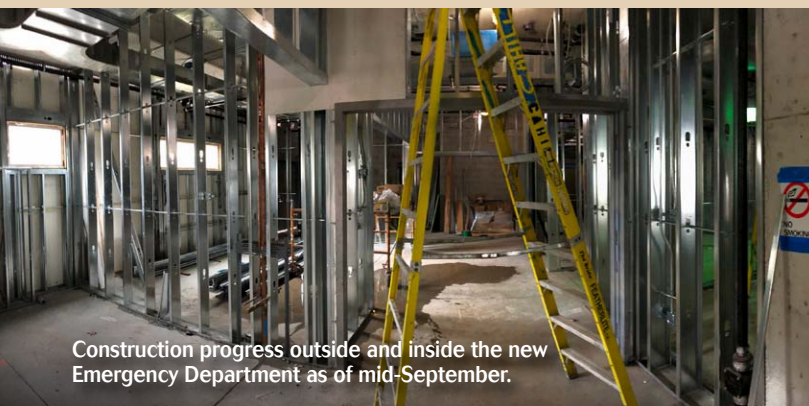
Construction progress outside and inside the new Emergency Department as of mid-September.

Speaking of the Emergency Department, we've had a very busy summer in the ED, resulting in increased wait times for patients coming in for diagnosis and treatment. Physician staffing has also become an issue. A major reason for this problem is that physicians who work in the ED have been retiring faster than they can be replaced. The hospital will be developing a strategy to recruit more physicians to help alleviate this situation, particularly since we can expect even more emergency visits once the new building is open for business.