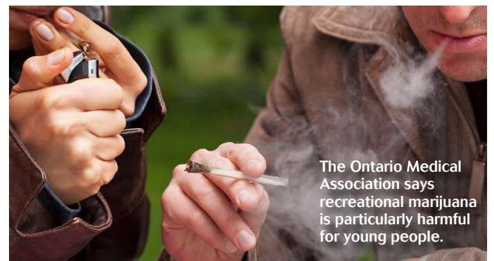
The Ontario Medical Association says recreational marijuana is particularly harmful for young people.

"The health risks caused by recreational marijuana can best be avoided by abstaining from use," the OMA says.